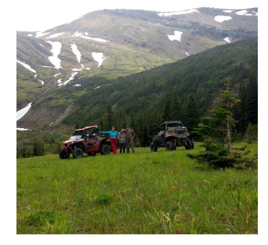
There's always time to stop, take a well deserved break and enjoy the scenery

The actual summit of Mt Spieker (1971 m) lies to the east, along a gentle 4 km long alpine ridge. The area is known for birds such as ptarmigan and golden eagle, many marmots make their homes among the rocks, and caribou are often spotted in the alpine.