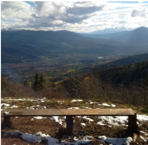
Rest stop along the trail to the top of Mount Hermann.

If time permits continuing down the Murray Forestry Service Road will bring you to spectacular Kinuseo Falls.